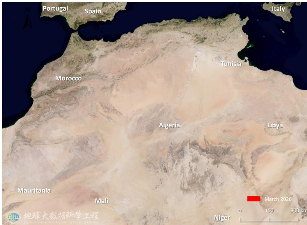
Fig. 2 Monitoring of Desert Locust damage in Algeria (March 2026)

influence of a small number of immature adults entering from the direction of Morocco, desert locust activity increased slightly compared with the previous month, although the overall situation remained low-density and localized. Monitoring results showed that in March 2026, desert locusts affected 21.7 thousand hectares of vegetation in Algeria, including 6.1 thousand hectares of cropland, 7.3 thousand hectares of grassland, and 8.3 thousand hectares of shrubland (Figure 2), accounting for 0.40‰, 0.58‰, and 0.32‰ of the country's total cropland, grassland, and shrubland areas, respectively. Sidi Bel Abbès recorded the most extensive damage, with 5.6 thousand hectares of affected vegetation, followed by Saïda with 5.0 thousand hectares. Tlemcen, Aïn Témouchent, Mascara and Laghouat were also affected, with 4.1, 3.2, 2.1 and 1.7 thousand hectares, respectively.