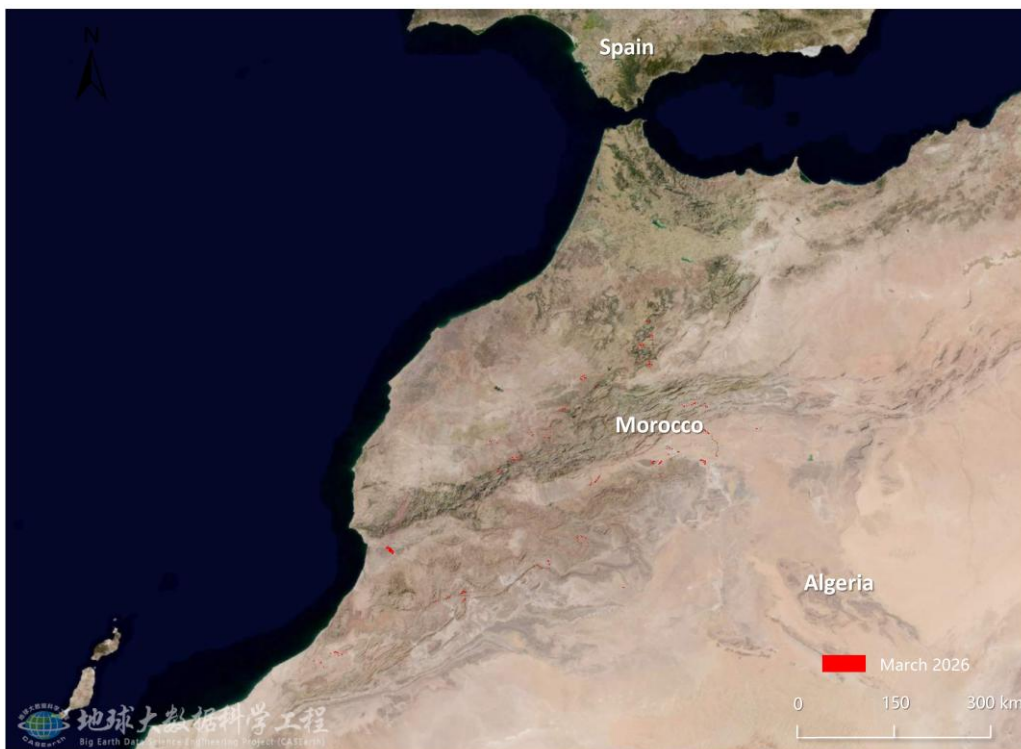
Fig. 1 Monitoring of Desert Locust damage in Morocco ((March 2026)

In March 2026, spring rainfall continued to increase in Morocco, and vegetation conditions in the southern and central regions were favorable, providing suitable conditions for desert locust egg-laying and breeding. Under the continued northward migration of populations from Western Sahara and southern Morocco, both adult and hopper activity remained relatively active, and population levels stayed high. Monitoring results showed that in March 2026, desert locusts affected 64.3 thousand hectares of vegetation in Morocco, including 10.7 thousand hectares of cropland, 18.9 thousand hectares of grassland, and 34.7 thousand hectares of shrubland (Figure 1), accounting for 0.14%, 0.28%, and 0.25% of the country's total cropland, grassland, and shrubland areas, respectively. Meknès-Tafilalet recorded the most extensive damage, with 24.4 thousand hectares of affected vegetation, followed by Souss-Massa-Draâ with 14.8 thousand hectares. Guelmim-Es-Semara, Marrakech-Tensift-Al Haouz and Tadla-Azilal were also affected, with 10.4, 8.0 and 6.7 thousand hectares, respectively.